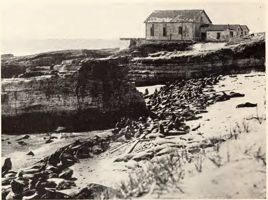
Fig. 1. California sea lions hauled out along a sandy beach with a group of immature elephant seals (right foreground). Año Nuevo Island, March 24, 1962

rocks on the seaward side. Año Nuevo Island has long been known to have the largest breeding rookery of this species south of Alaska. The breeding season is June and July during which time the adult males as well as the bachelors are present. During most of the remainder of the year the population consists of varying numbers of females, pups and yearlings.